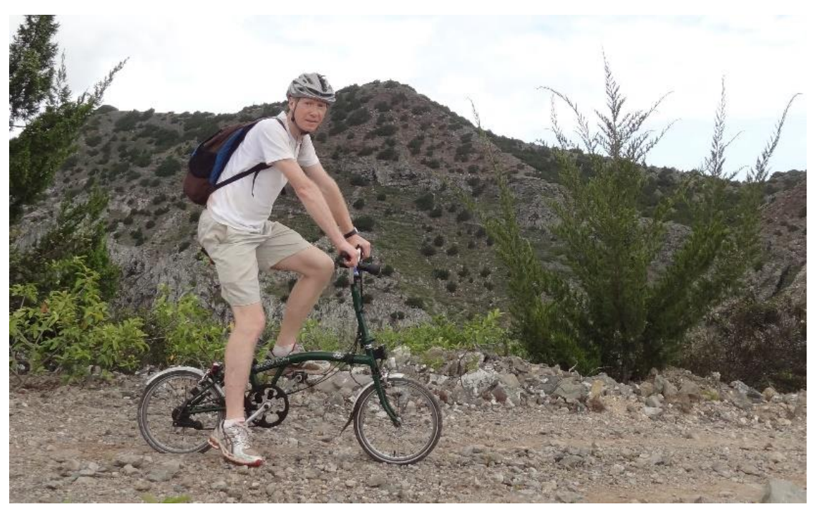
Figure 3 The author heading off to the Letterbox Peninsula