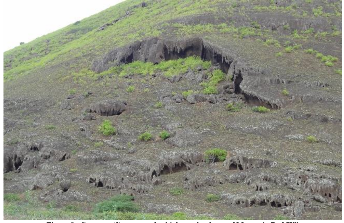
Figure 8 Gas caves(?), approx. 2m high, on the slopes of Mountain Red Hill

Notable throughout the island, but particularly visible on the slopes of Mountain Red Hill, are the caves and ledges which appear to be embedded in the volcanic deposits. They may have been caused by gas trapped in pyroclastic flows, but during my visit I was not able to establish their origin definitively.