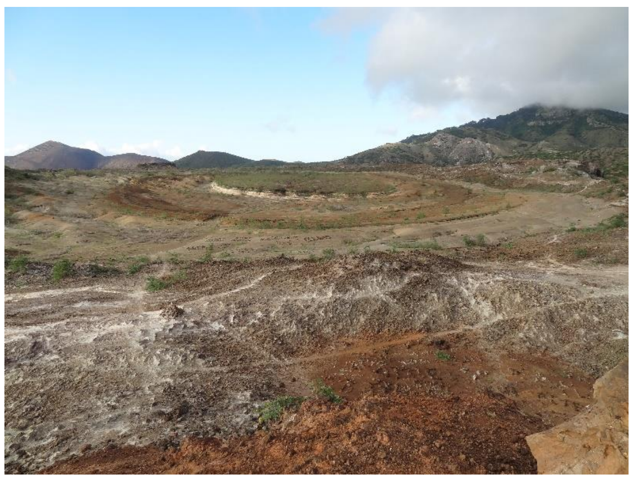
Figure 9 Devil's Riding School

Among the many curious features of Ascension, one of the strangest must be the Devil's Riding School. This circular depression, around 700 m in diameter, is thought to be a relic of a massive volcanic explosion and was first described by Charles Darwin in 1836. The crater filled with water and as this dried and eroded, successive layers of ash were exposed, each a different colour and giving the crater its characteristic "bullseye" appearance. White coloured soft chalky globes about 5cm in diameter can be recovered from the centre of the "Riding School". The chalky coats possibly coalesced around smaller hard pebbles which rolled around the bottom of the lake as it dried up. But the actual origin of these objects perplexed Darwin and still seems obscure today. They are locally known as Devils Eyeballs.