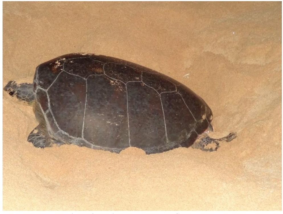
Figure 4 Nesting green turtle on Clarence Bay

Although the beaches are good, the sea is violent and treacherous – not ideal for swimming. And many of the beaches themselves are protected sites for nesting turtles. The interior is a jumble of inhospitable lava flows, scoria cones (of which there are at least 50) and cinder.