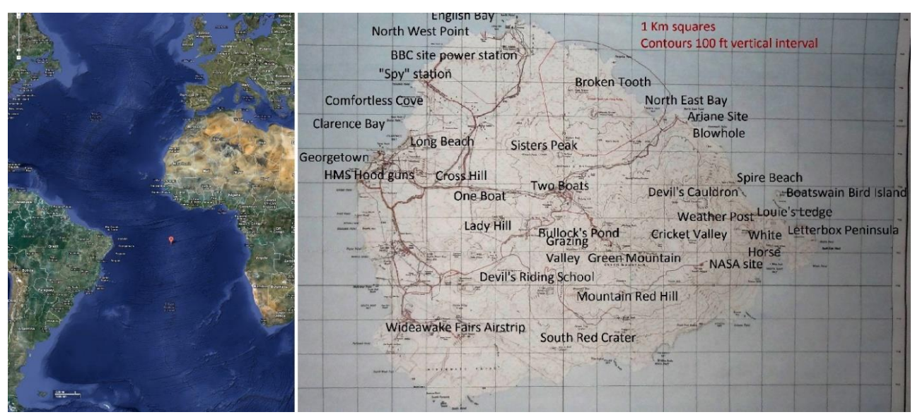
Figure 1 Overview (left) and detailed (right) maps. The red dot on the left marks Ascension Island

equally isolated Atlantic islands, Ascension is a British Overseas Territory and is administered by the Governor of Saint Helena, Ascension and Tristan da Cunha, who resides in St Helena.