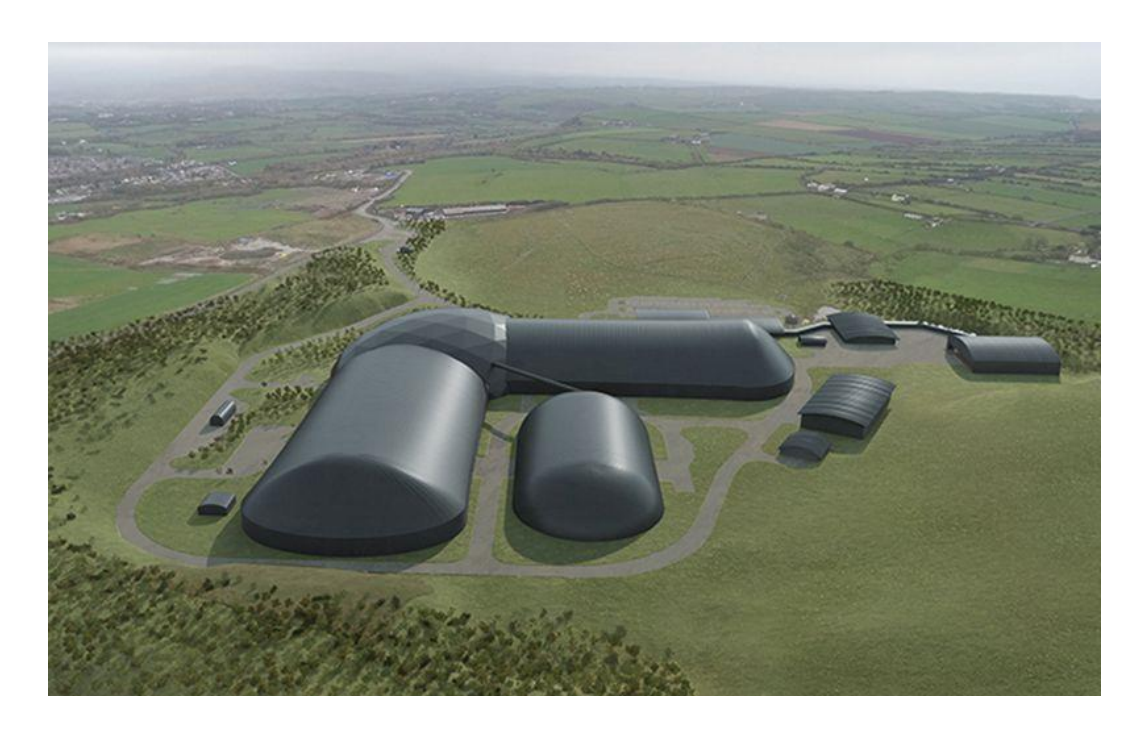
Impression of proposed pithead at Woodhouse Colliery-West Cumbria Mining

Cumbia County Council, the mineral planning authority, has approved the project, but the grant of planning permission is subject to a holding direction from the Secretary of State for Housing, Communities and Local Government, pending a decision whether or not to call in the application for determination.