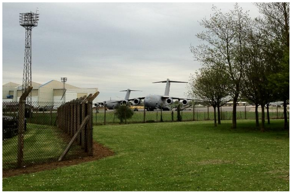
Figure 2 RAF Brize Norton

My purpose for visiting was mostly to explore on foot, but I do have an interest in mid-ocean volcanic islands, so I was keen to see how the island compared with some of the more accessible destinations I'd also visited – the Canaries, Madeira, Hawaii, Iceland and so-on. My first impression on arrival was that the island is hot and arid, but strangely British. Traffic drives on the left, and familiar British road signs are used. A curious mix of St Helena pounds, pounds Sterling and US dollars forms the local currency.