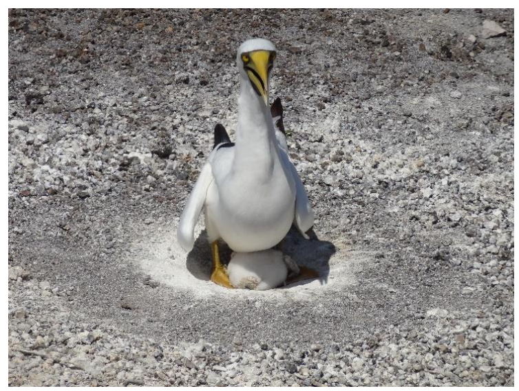
Figure 7 Masked Booby nesting on Letterbox Peninsula

scramble down from Louie's Ledge. But worth making the journey because the Peninsula is the only fissure flow on the island – all the other flows emerge from single vents. While there, you can