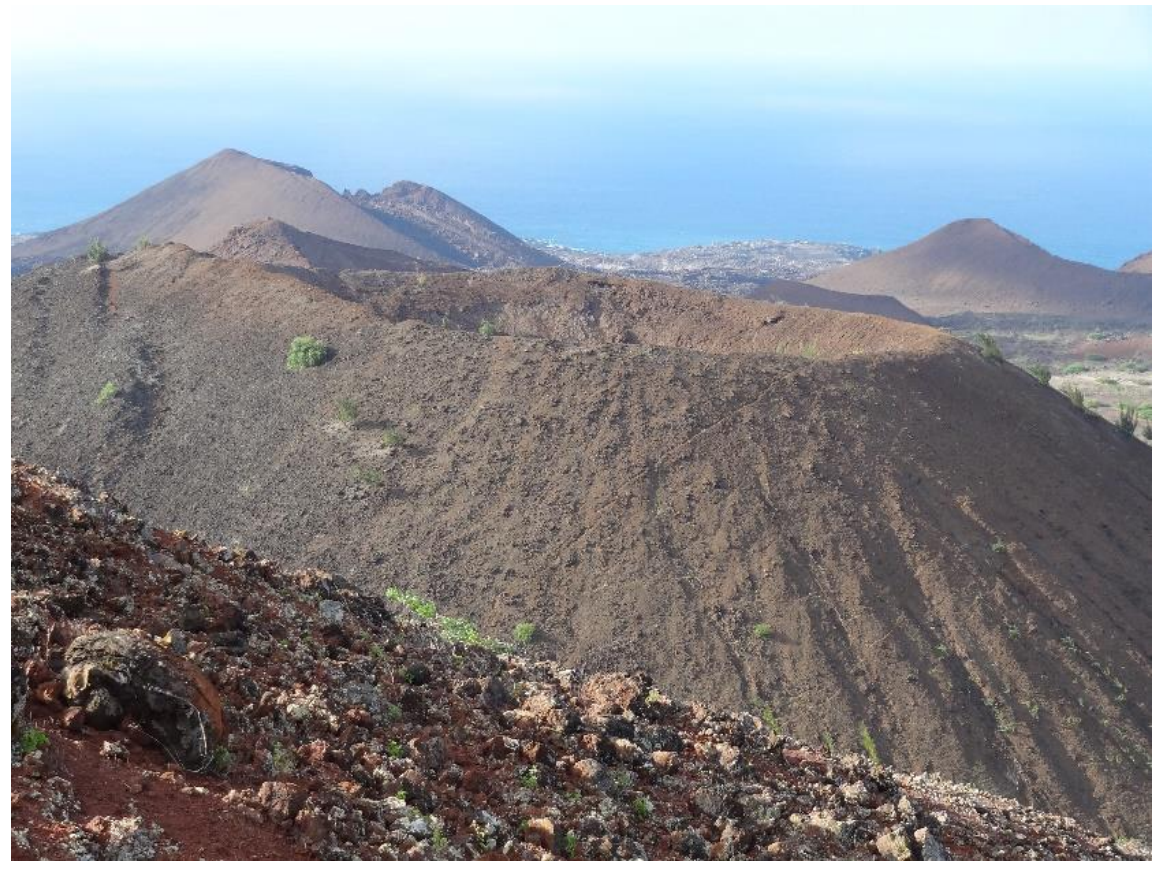
Figure 5 Perfect Crater from Sisters Peak

The aptly-named Perfect Crater, accessible via an ankle-twisting trail from Sisters Peak, is an excellent example of a scoria cone and is in fact the one of the few on the island with a complete rim.