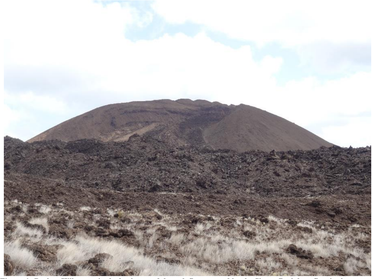
Figure 6 Broken Hill crater in the background, breach flow crossed by the Sisters Peak lava flow in the foreground

Whilst there is abundant evidence of recent volcanism, there is still no definitive understanding of when the most recent eruptions actually occurred. There have been none since the island's discovery on Ascension Day (hence the name), 1501. But Argon-Argon dating some of the lava flows to the north of the island – near Sisters Peak – suggest they were deposited in the last 2000 years. From Sisters Peak, it is possible to see how the breach flow from nearby Broken Tooth crater is crossed by the subsequent and most recent eruptive flows from Sisters. To access Broken Tooth itself involves a hazardous crossing of this featureless lava flow. The sense of trepidation is enhanced when you remember there is no mobile phone network to call for help, and no rescue service even if you could. The guidebook advises you to follow the cables laid across the lava which were used in the past by the military to detonate and test explosive devices at the foot of the crater. Not exactly a reassuring waymark.